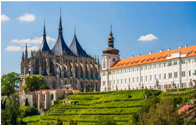
Kutná Hora - St. Barbara's Church

Offer of optional trips will be sent before the start of the summer school.