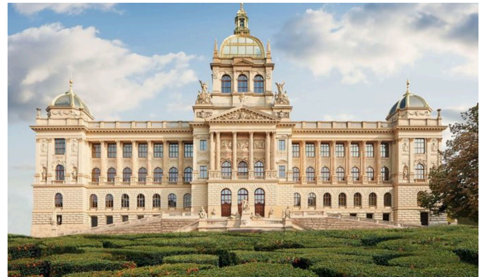
Prague - National Museum