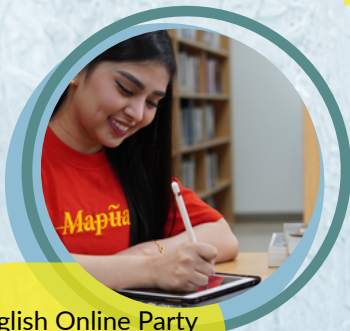
English Online Party for speaking and listening exercises