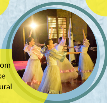
Cultural immersion from various activities like welcome dinner, cultural tour