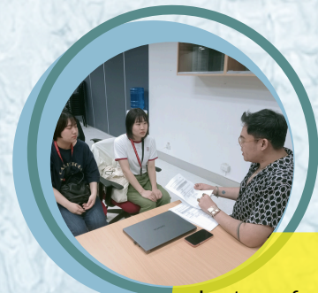
Lectures from English professors