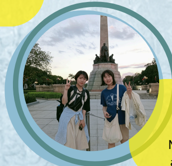
Visit culturally important places in Manila - Intramuros, National Museum, and Taal Volcano- a volcano within a volcano!